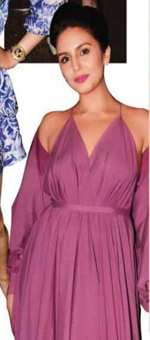
Anti-clockwise: Actors Diana Penty, Shah Rukh Khan, Aditi Rao Hydari, Huma Qureshi, Sidharth Malhotra, Kangana Ranaut and Rajkumar Rao at the birthday bash of filmmaker Anand L Rai.