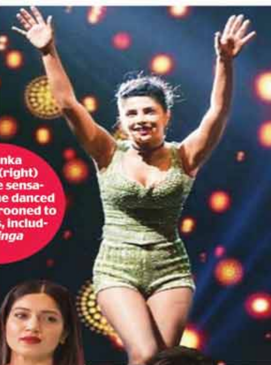
Priyanka Chopra (right) was quite sensational as she danced and even crooned to her songs, including Pinga

(Agencies) THE Bollywood titans of the year 2015 — Bajrangi Bhaijaan and Bajirao Mastani — emerged victorious at the International Indian Film Academy (IIFA) Awards 2016 with the Salman Khanstarrer winning best picture while Sanjay Leela Bhansali's magnum opus taking home best director gong. Director Kabir Khan heaped praise on his lead star as he accepted the best picture award at the 17th edition of the awards. "Thank you IIFA, thank you Salman for starring and also producing the movie. He let me do the film the way I wanted to." Bhansali was honoured with the award by his lead actors — Ranveer Singh, Deepika Padukone and Priyanka Chopra. "No other film of mine has got so much love like Bajirao. I am surprised to see how it has done so well this awards season. It is a special moment for me to get this awards by my three favourite actors. I don't want to thank anyone for the film because a 'thank you' is not enough," the director said. The historical romantic saga earned Ranveer the best actor trophy for his portrayal of the great Maratha warrior Peshwa Bajirao. The actor began his acceptance speech by thanking his director but did not miss a chance to show his affection towards rumoured girlfriend Deepika. "I am so glad I won.