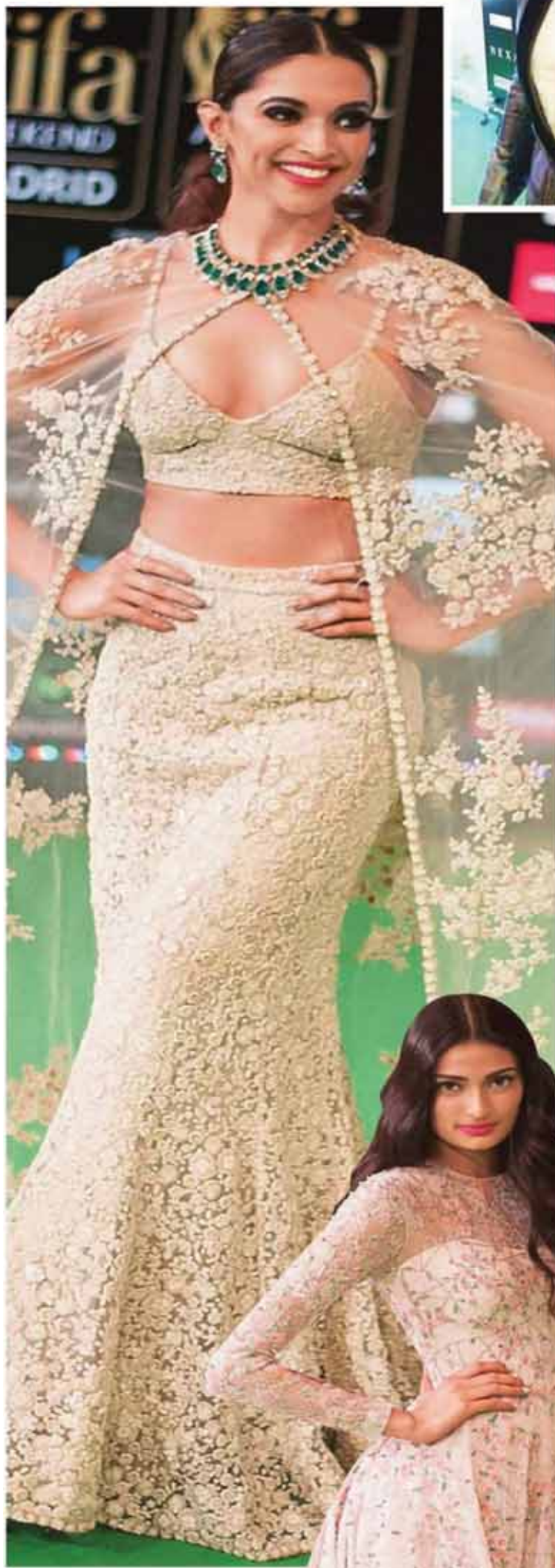
Deepika Padukone bagged the Best Actress for Piku . (Right) Athiya Shetty.