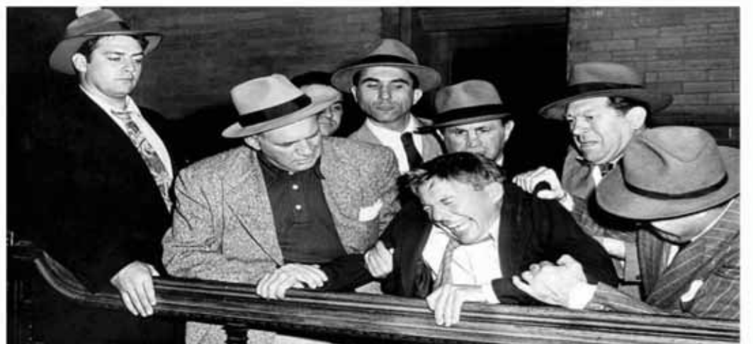
Horror In The Bylanes in collaboration with Lightcube Film Society will be hosted from June 29 to September 7.