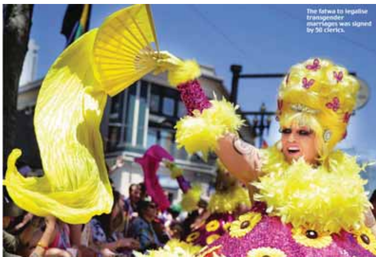
The fatwa to legalise transgender marriages was signed by 50 clerics.

(Agencies) A group of clerics in Pakistan has declared marriage between transgender individuals permissible in Islam. They also said they have a right to be buried in Muslim ceremonies, according to a copy of a religious edict Reuters obtained on Monday. Further, transgender people have full rights under Islamic inheritance law, the Tanzeem Ittehad-i-Ummat Pakistan, a little-known clerical body in the eastern city of Lahore, said in its fatwa. "It is permissible for a transgender person with male indications on his body to marry a transgender person with female indications on her body," said the document, signed by 50 clerics and issued on Sunday. "Also, normal men and women can also marry such transgender people as have clear indications on their body." But it did not say what these indications were. In 2012, Pakistan's Supreme Court declared equal rights for transgender citizens, including the right to inherit property and assets, preceded a year earlier by the right to vote. Pakistani