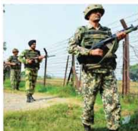
BSF to spend ₹20 crore on J&K border.