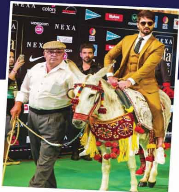
(From left) Abhay Deol, Riteish Deshmukh & Ranveer Singh. (Right) Shahid Kapoor arrives on a donkey to pose on the green carpet before the awards.