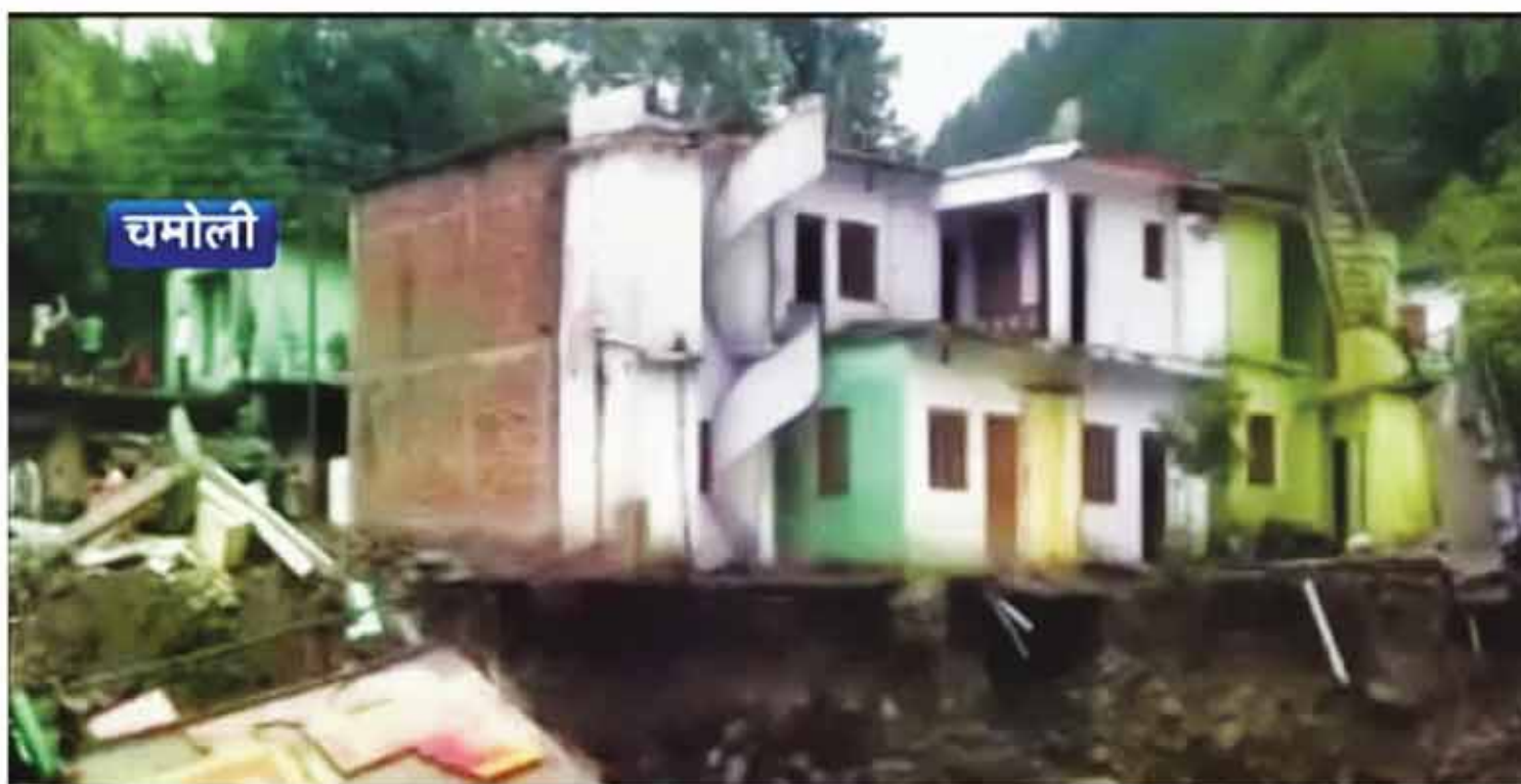
TV grabs show the destruction caused by torrential rains and landslides that hit Uttarakhand's Pithoragarh and Chamoli districts on Friday killing at least 30 people with many others missing. CM Harish Rawat announced ₹2 lakh for the kin of each deceased.