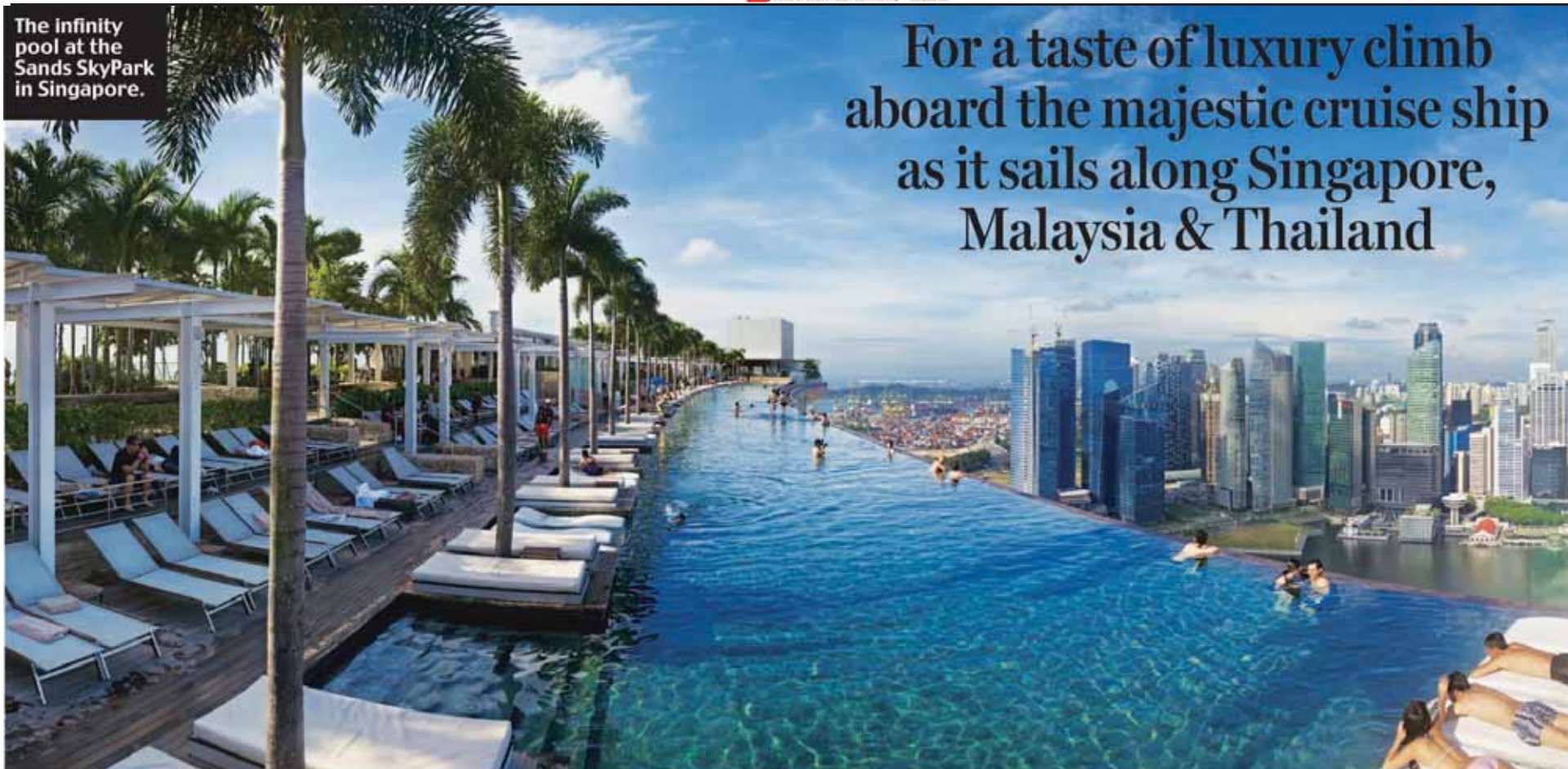
The Infinity pool at the Sands SkyPark in Singapore.

For a taste of luxury climb aboard the majestic cruise ship as it sails along Singapore, Malaysia & Thailand